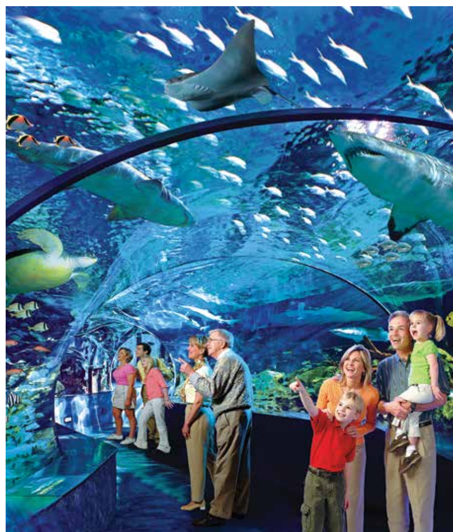
Ripley's Aquarium of Canada