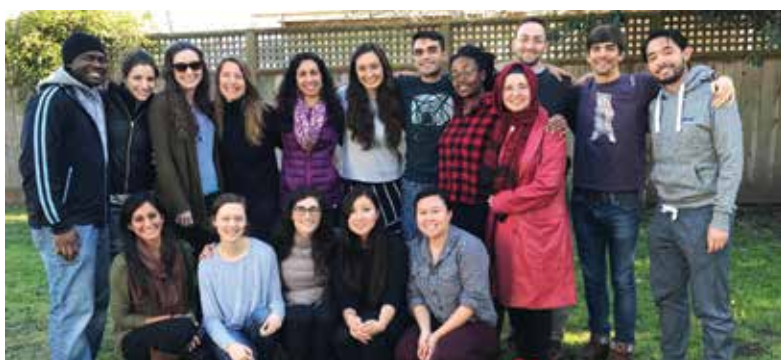
San Mateo County Behavioral Health and Recovery Services