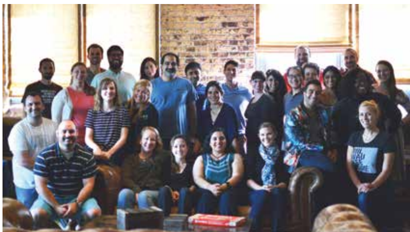
Medical College of Wisconsin