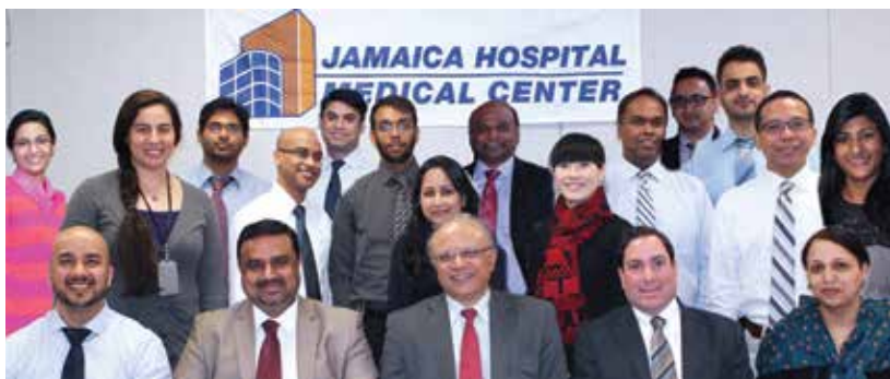
Jamaica Hospital Medical Center