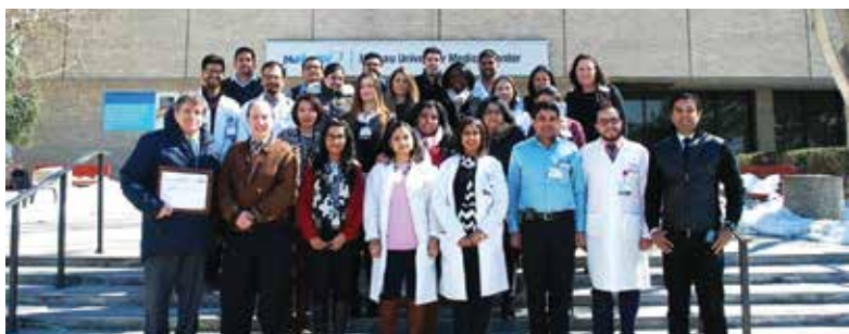
Nassau University Medical Center