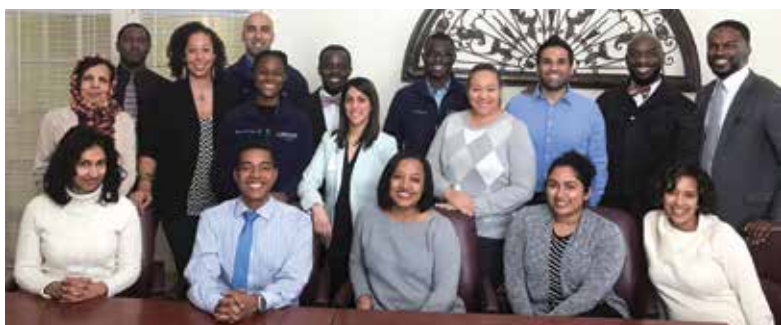
Morehouse School of Medicine