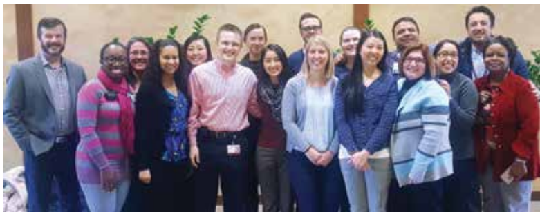
University of Cincinnati Medical Center