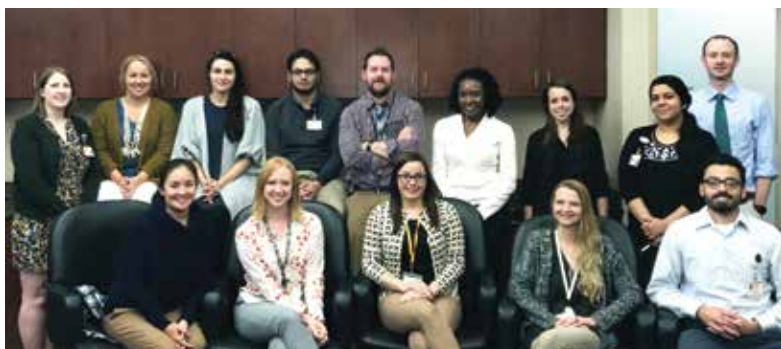
Wake Forest University School of Medicine