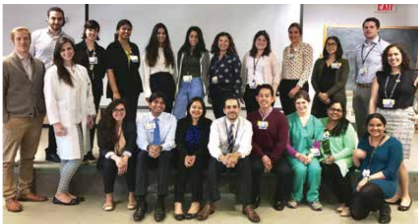
Maimonides Medical Center