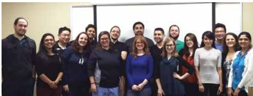
Charleston Area Medical Center/West Virginia University (Charleston Division)